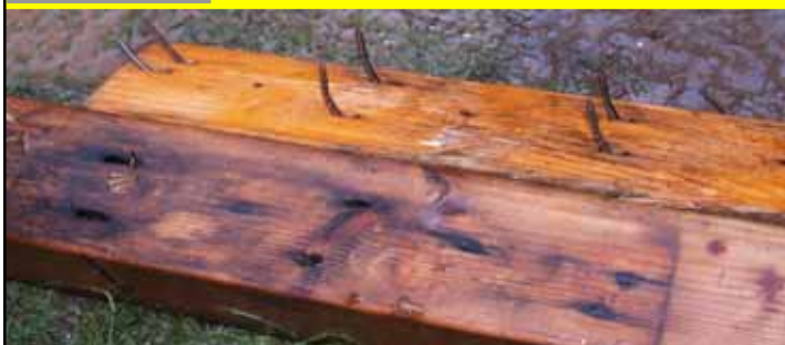
Raker/Picket Tests 16