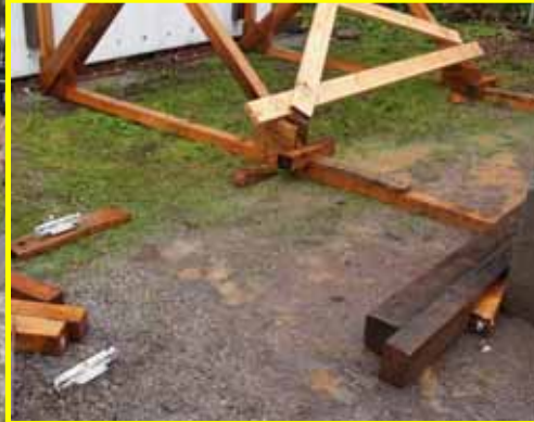
Raker/Picket Tests 15