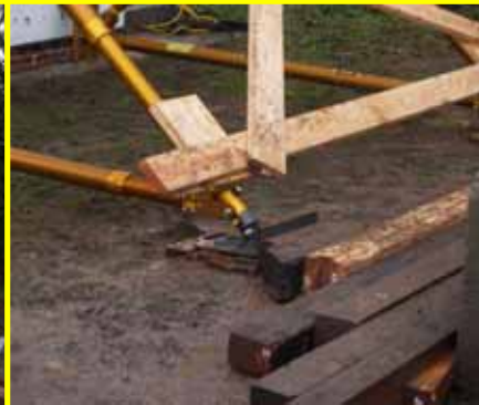
Raker/Picket Tests 19