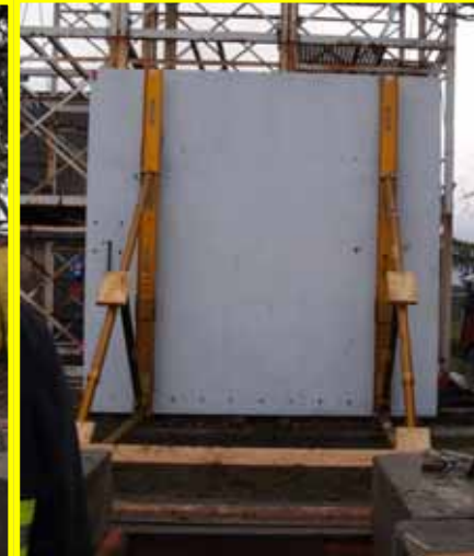
Raker/Picket Tests 20