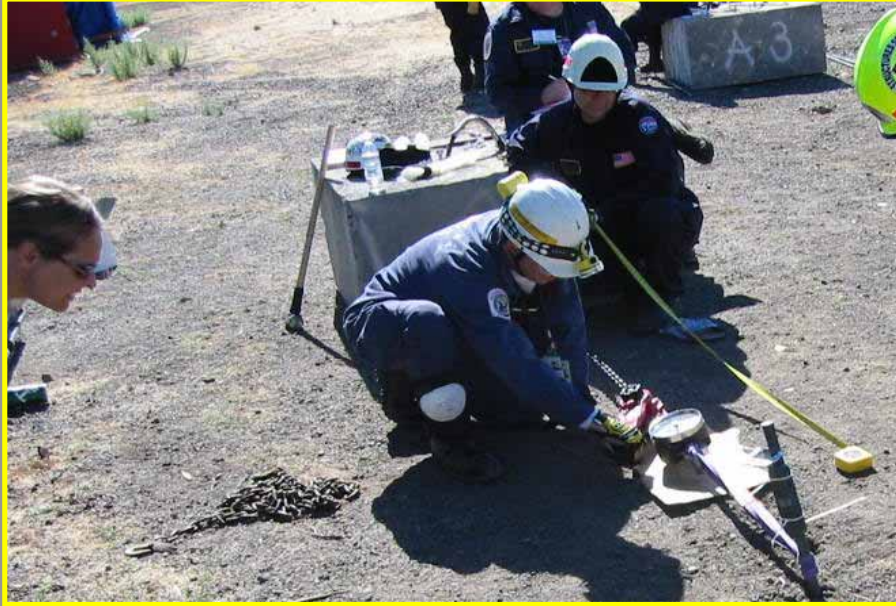
Raker/Picket Tests 41