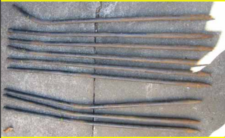
Raker/Picket Tests 42